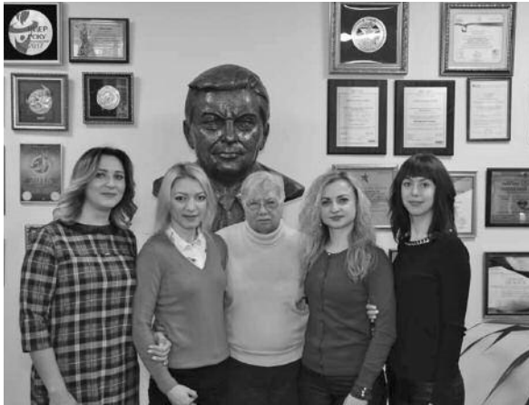
Fig. 1. Quality Control Department of L.I. Medved's Research Centre of Preventive Toxicology, Food and Chemical Safety, Ministry of Health of Ukraine

ments of National State Standard ISO/IEC 17025 (accreditation certificate of the National Accreditation Agency of Ukraine № 2H375).